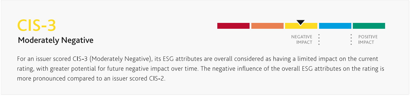
Exhibit 3 ESG Credit Impact Score