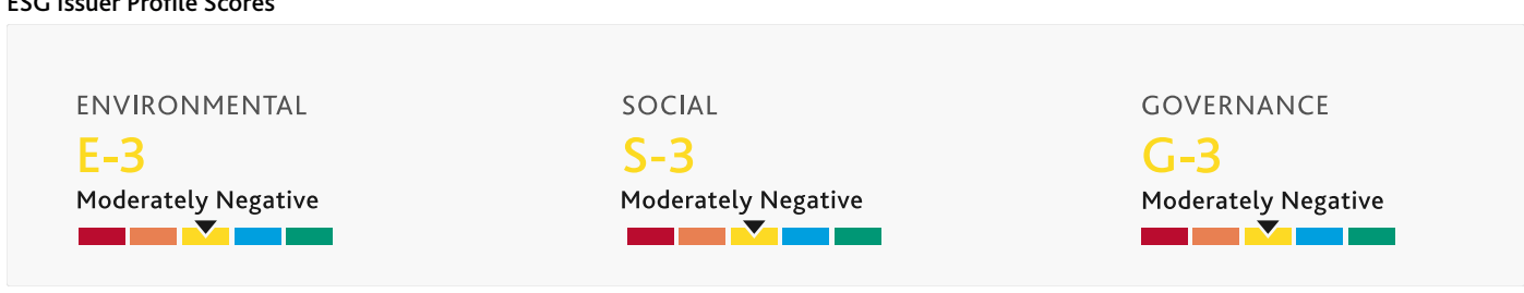
Exhibit 4 ESG Issuer Profile Scores

PFP's CIS is moderately negative reflecting moderate exposure to environmental and social risks along with a moderately negative governance profile, although the HA benefits from a supportive regulatory framework and support from the UK government.