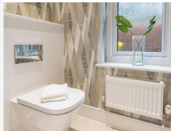
Photography from previous Places for People development.