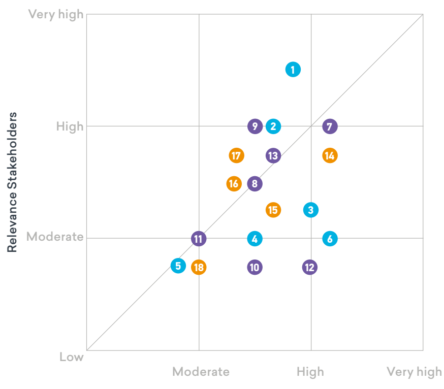
Relevance Places for People