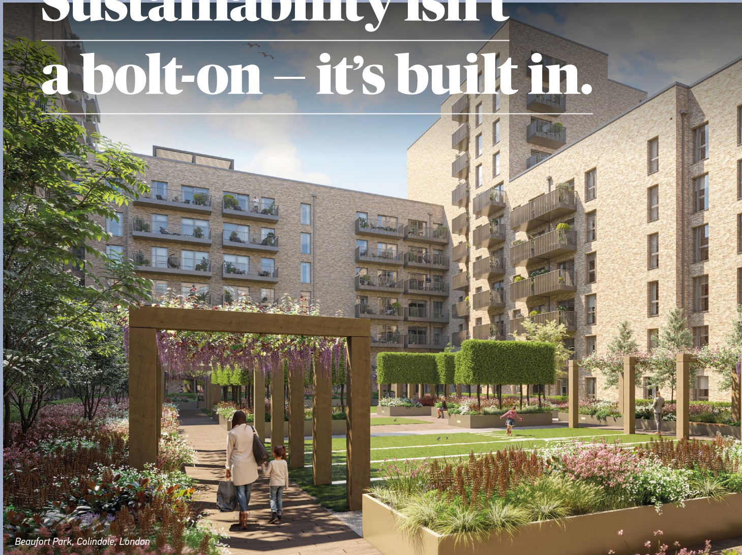
Beaufort Park, Colindale, London