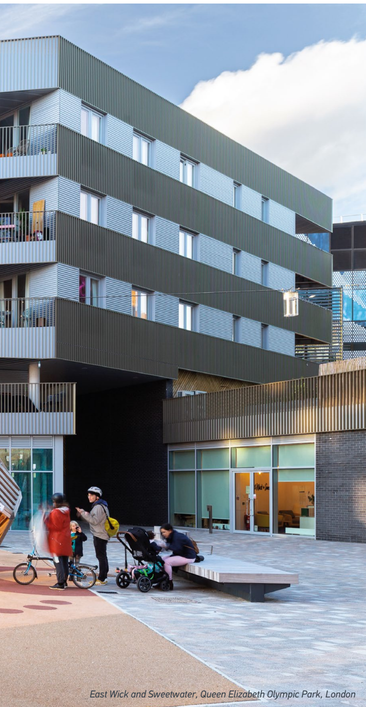
East Wick and Sweetwater, Queen Elizabeth Olympic Park, London